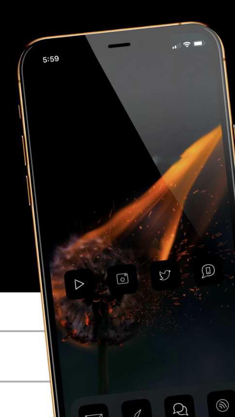
Law. 25 // privacy policy

As a company, we are committed to respecting the privacy of our customers and maintaining the confidentiality of their personal information.